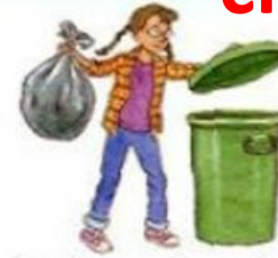
2. take out the garbage