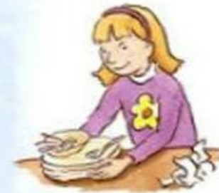
4. clear the table