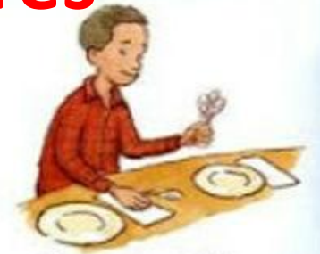
3. set the table