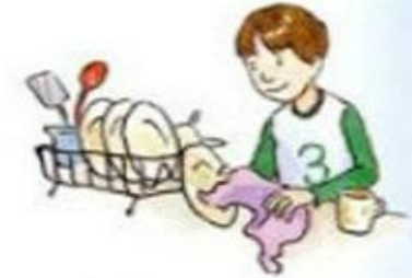
6. dry the dishes