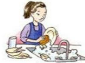
5. wash the dishes