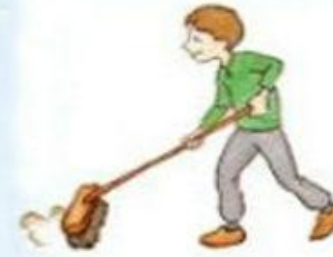
1. sweep the floor